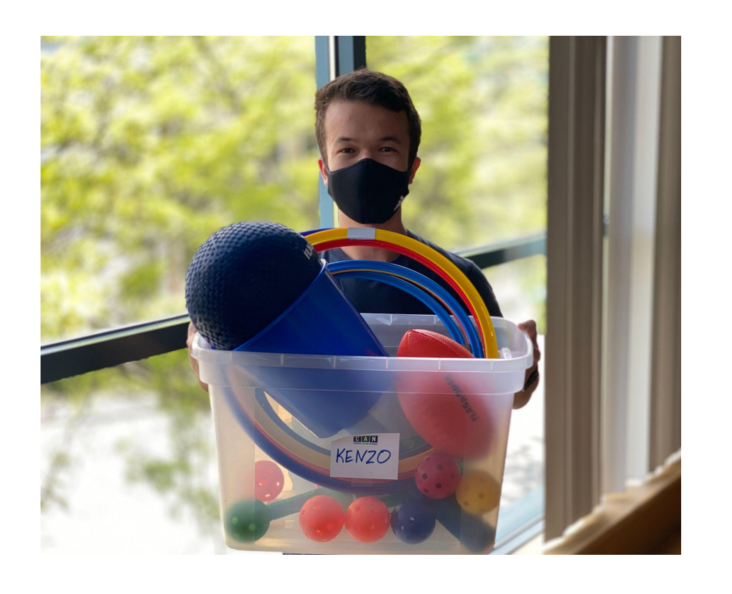
I will use equipment from the box my coach has for me. My box will have my name on it!