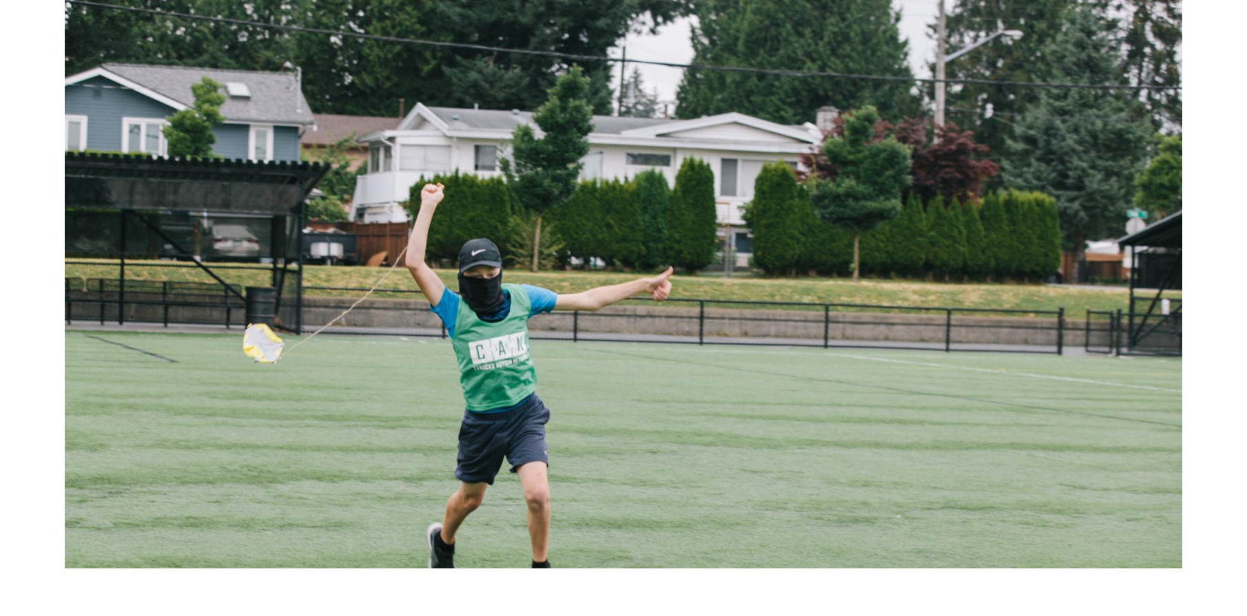
I am going to CAN Summer Day Camp! Camp is super fun!